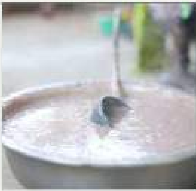
Uji ya wimbi

Every child deserves the chance to grow, and to achieve their full potential. However, for thousands of children in Tanzania and Kenya, the reality of hunger stands in their way. The Fill My Cup appeal provides a nourishing breakfast for school-going children to help them focus on their education and have a brighter future.